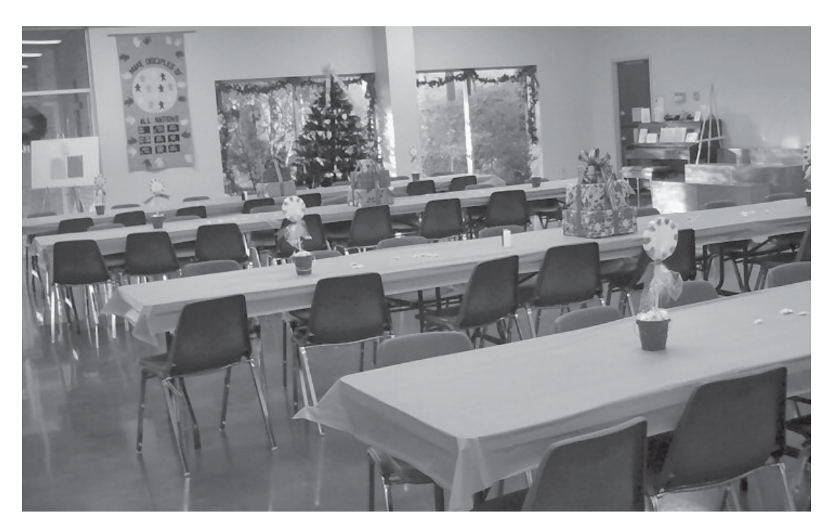
Beautiful setup - ready to go