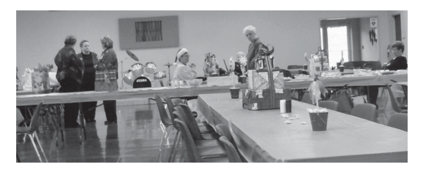
Gathering early in the morning