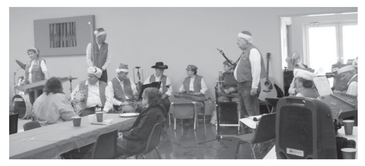
Entertainment - the Dulcimer group