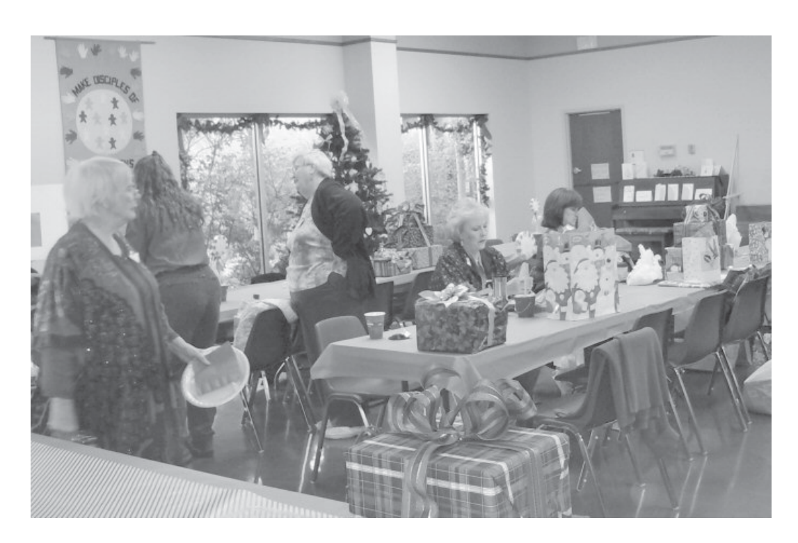
Fellowship among the pals