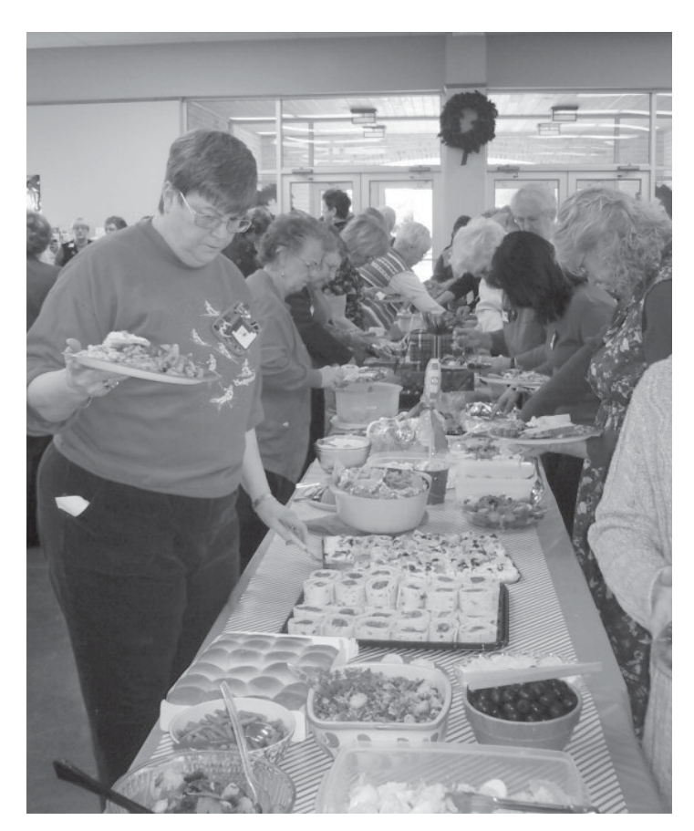
Down the line one more time - yum yum