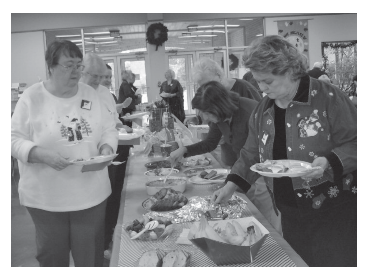
Yummy breakfast potluck