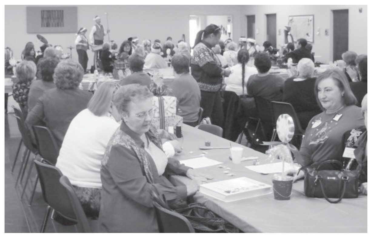
Enjoying the fellowship