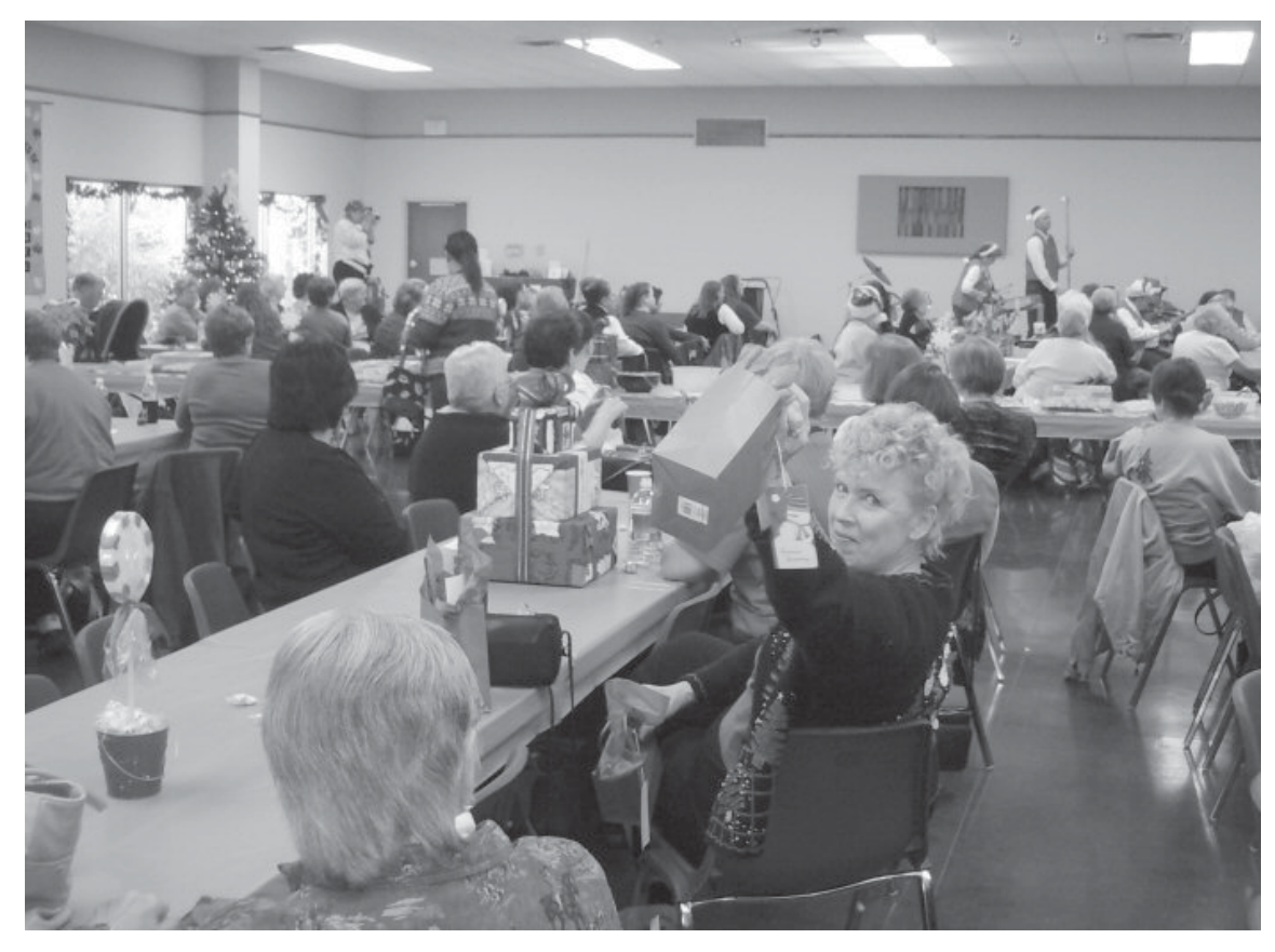
Everyone received a doorprize